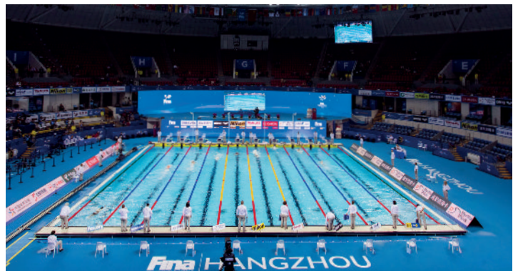
Hangzhou, China 2018 FINA WORLD SWIMMING CHAMPIONSHIPS (25m)