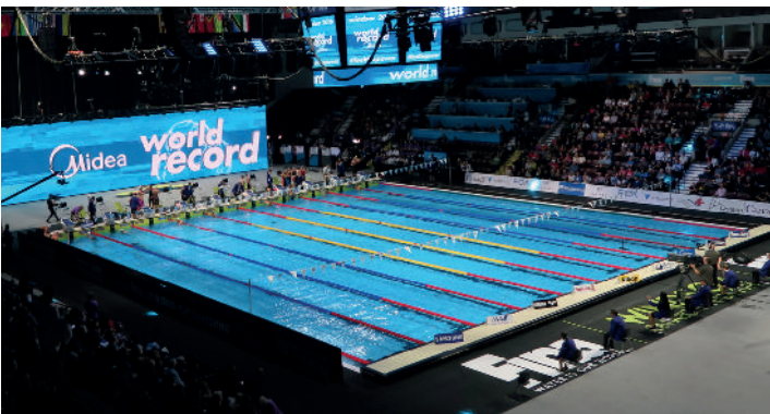
Windsor, Canada 2016 FINA WORLD SWIMMING CHAMPIONSHIPS (25m)